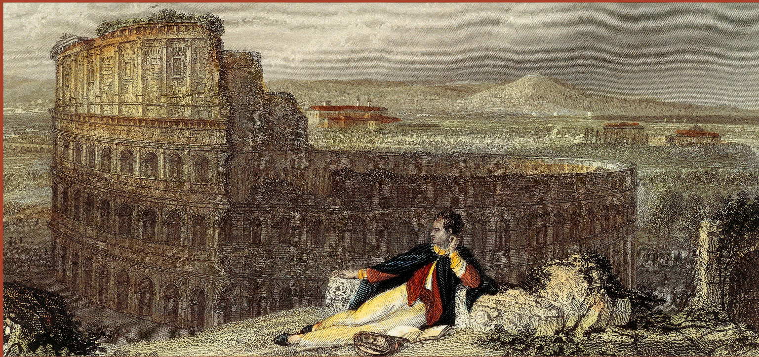
Lord Byron Contemplating the Colosseum (color engraving by Arthur Willmore or James Tibbets Willmore, after William Westall / Bibliotheque des Arts Decoratifs, Paris, France / G. Dagli Orti / © NPL – DeA Picture Library / Bridgeman Images)